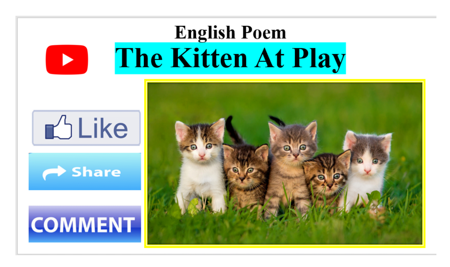
Questions & Answers of the Poem