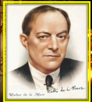
Walter de la Mare